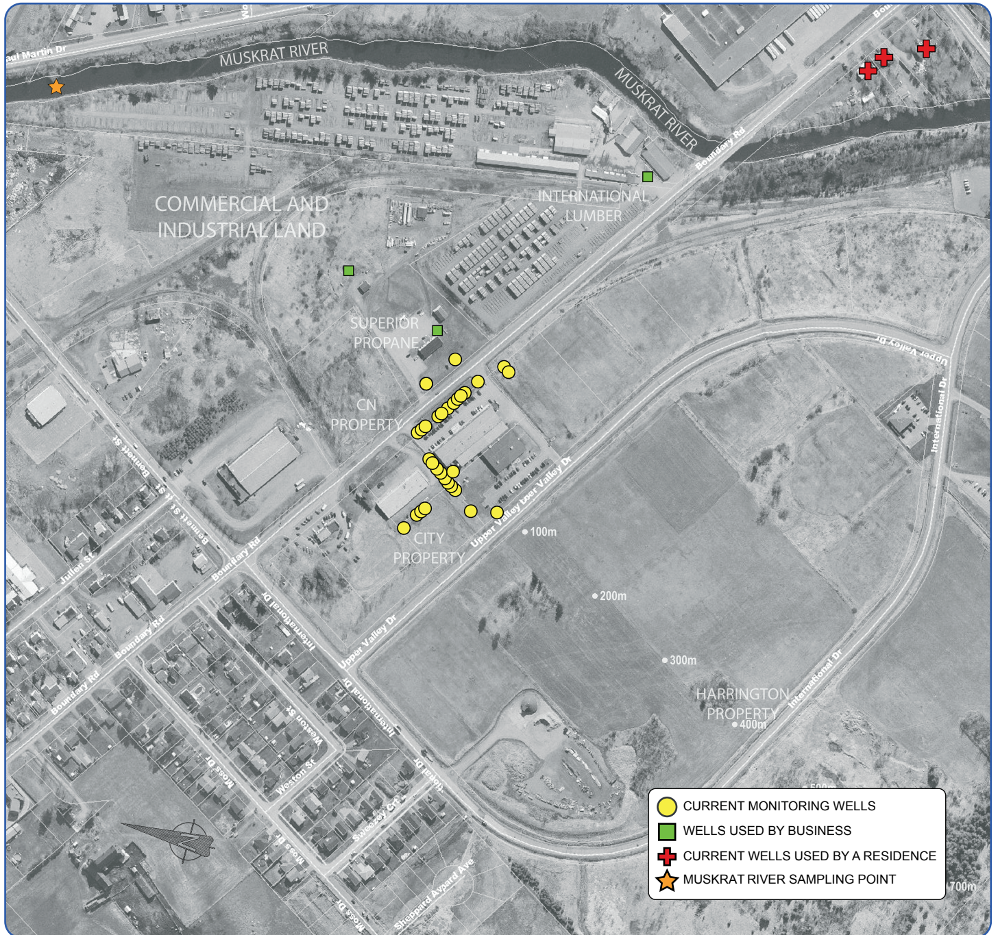
Figure 2: Wells in the vicinity of SRB